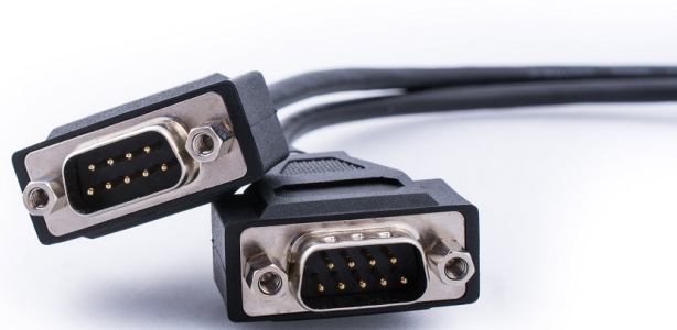
Figure 3: CAN/LIN connector on Kvaser Hybrid 2xCAN/LIN

The Kvaser Hybrid 2xCAN/LIN has two LIN/CAN channels in two separate 9-pin D-SUB CAN connectors (see Figure 3). See Section 4.3, CAN/LIN connector, on Page 13 for pinout information.