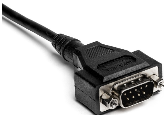
Figure 3: CAN/LIN connector on Kvaser Hybrid CAN/LIN

The Kvaser Hybrid CAN/LIN has one CAN/LIN channel in a 9-pin D-SUB CAN connector (see Figure 3). See Section 4.3, CAN/LIN connector, on Page 13 for pinout information.