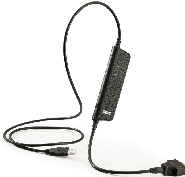
Figure 1: Kvaser Hybrid CAN/LIN

Kvaser Hybrid CAN/LIN is a single channel interface where the channel can be opened either as CAN or LIN. The Kvaser Hybrid CAN/LIN is compatible with applications that use Kvaser's CANlib and LINlib.