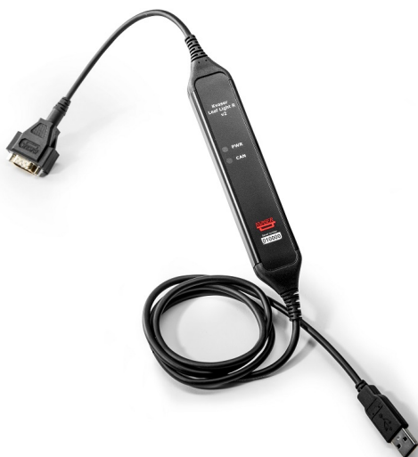
Figure 1: Kvaser Leaf Light R v2

Kvaser Leaf Light R v2 is a reliable low cost product. In hostile environments where dust and water are the norm, the IP65 rated housing assures reliable protection. With a time stamp precision of 100 microseconds it handles transmission and reception of standard and extended CAN messages on the bus. It is compatible with applications that use Kvaser's CANlib.