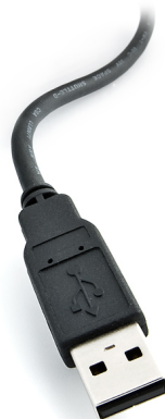
Figure 2: A standard USB type “A” connector.

The Kvaser Leaf Light R v2 has a standard USB type “A” connector.