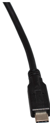
Figure 2: A standard USB Type-C connector.

The USB connector for the Kvaser U100-C is a standard USB Type-C connector (see Figure 2).