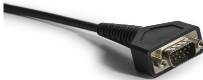
Figure 3: The 9-pin D-SUB CAN connector.

The CAN connector for the Kvaser U100-C is the 9-pin D-SUB connector (see Figure 3) which has the pinout described in Table 2 on Page 9.