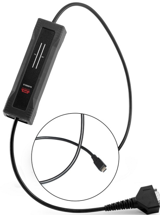
Figure 1: Kvaser U100-C

Kvaser U100-C is a small, yet powerful, CAN to USB interface. It provides real-time transmission and reception of standard and extended CAN messages on the bus with a high timestamp precision, and is compatible with applications that use Kvaser's CANlib.