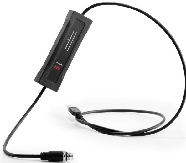
Figure 1: Kvaser U100-X2

Kvaser U100-X2 is a small, yet powerful, CAN to USB interface. It provides real-time transmission and reception of standard and extended CAN messages on the bus with a high timestamp precision, and is compatible with applications that use Kvaser's CANlib.