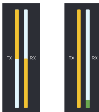
Figure 7: The yellow-lit area of the LED bars is proportional to the bus load. Both images indicate a bus load of 100%.

at 50% bus load. Figure 7 on Page 12 shows two different bus load conditions. The image on the left shows the unit transmitting and receiving data corresponding to 50% bus load in each direction for a total of 100% bus load. The image on the right shows the unit transmitting data corresponding to 100% bus load.