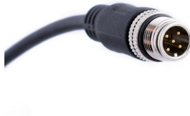
Figure 3: M12 5-pole CAN connector.

The CAN connector for the Kvaser U100-X2 is the 5-pole M12 plug (see Figure 3) which has the pinning described in Table 2 on Page 9.