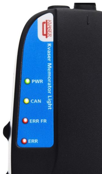
Figure 3: LEDs on the Kvaser Memorator Light HS v2.

The Kvaser Memorator Light HS v2 is equipped with four LED indicators. The following tables describe the status functions of the LEDs.