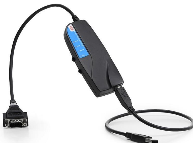
Figure 1: Kvaser Memorator Light HS v2

The Kvaser Memorator Light HS v2 is an advanced portable CAN data logger. The device features two CAN message buffers that are used as ring (FIFO) buffers.