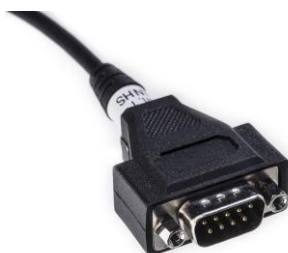
Figure 2: CAN connector on Kvaser Memorator Light HS v2