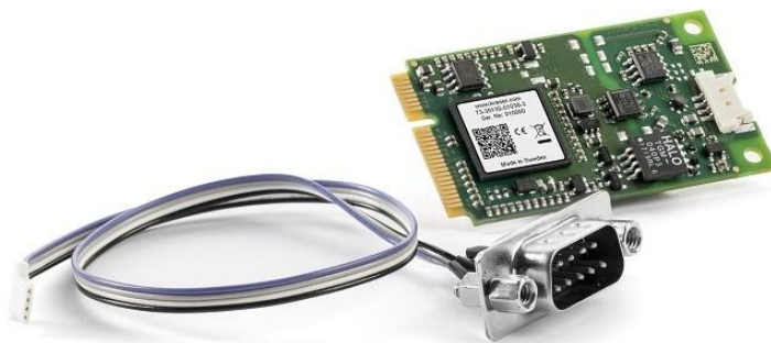
Figure 1: Kvaser Mini PCI Express HS v2

Kvaser Mini PCI Express HS v2 is a small, yet advanced, real time CAN interface that handles transmission and reception of standard and extended CAN messages on the bus with a high time stamp precision. The Kvaser Mini PCI Express HS v2 is compatible with applications that use Kvaser's CANlib.