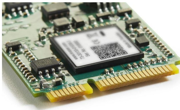
Figure 2: Mini PCI Express connector

The Kvaser Mini PCI Express HS v2 is a Card of type F2 (Full-Mini with bottom side keep outs).