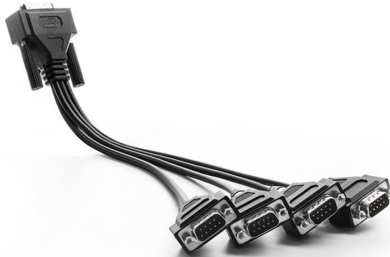
Figure 6: The HD26-4xDS9 Splitter