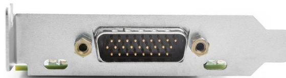
Figure 2: CAN connector on Kvaser PCIEcan 4xHS

The Kvaser PCIEcan 4xHS has four CAN channels in a single 26-pin HD D-SUBCAN connector (see Figure 2). See Section 4.2, CAN connectors, on Page 9 for pinout information.