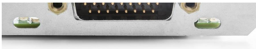
Figure 3: LEDs on the Kvaser PCIEcan 4xHS.

The Kvaser PCIEcan 4xHS has four yellow LED indicators, one for each channel, that indicates with a short flash that a CAN message was received or sent. A single flash may be hard to see and a continuous set of flashes will be indistinguishable from a steady light.