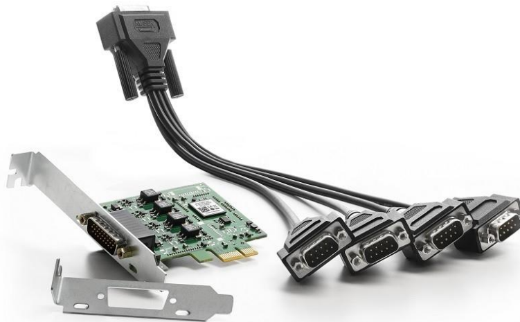
Figure 1: Kvaser PCIEcan 4xHS

Kvaser PCIEcan 4xHS is a small, yet advanced, CAN multi channel real time CAN interface that handles transmission and reception of standard and extended CAN messages on the bus with a high time stamp precision. It is compatible with applications that use Kvaser's CANlib.