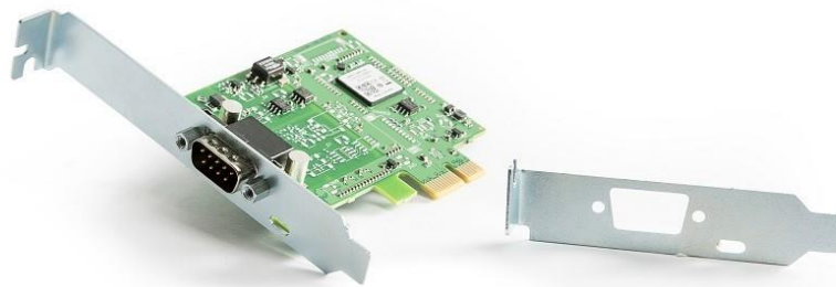
Figure 1: Kvaser PCIEcan HS v2

Kvaser PCIEcan HS v2 is a small, yet advanced, real time CAN interface that handles transmission and reception of standard and extended CAN messages on the bus with a high time stamp precision. The Kvaser PCIEcan HS v2 is compatible with applications that use Kvaser's CANlib.