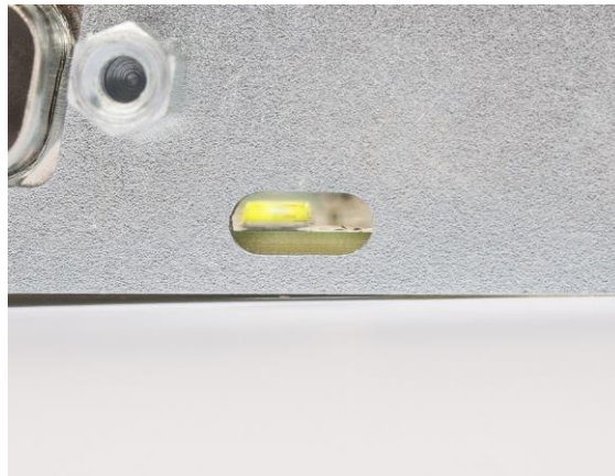
Figure 3: LED on the Kvaser PCIEcan HS v2.