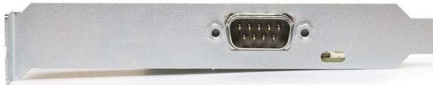
Figure 2: CAN connector on Kvaser PCIEcan HS v2

The Kvaser PCIEcan HS v2 has a single CAN channel with a 9-pin male D-SUB CAN connector (see Figure 2). See Section 4.2, CAN connectors, on Page 9 for pinout information.