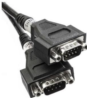
Figure 2: CAN connectors on Kvaser USBcan Light 2xHS

The Kvaser USBcan Light has two CAN Hi-Speed channels with 9-pin D-SUB CAN connectors (see Figure 2). See Section 4.2, CAN connectors, on Page 9 for pinout information.