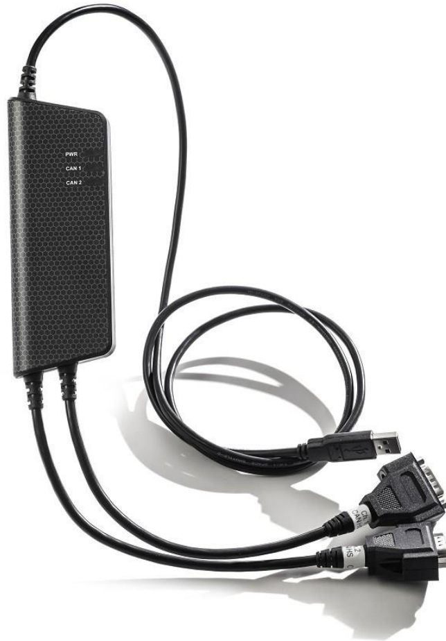
Figure 1: Kvaser USBcan Light

Kvaser USBcan Light is a reliable low cost product. With a time stamp precision of 100 microseconds it handles transmission and reception of standard and extended CAN messages on the bus. It is compatible with applications that use Kvaser's CANlib. This guide applies to Kvaser USBcan Light devices listed in Table 1.