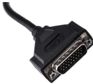
Figure 3: CAN connector on Kvaser USBcan Light 4xHS

The Kvaser USBcan Light 4xHS has four CAN Hi-Speed channels in a single 26-pin HD D-SUB CAN connector (see Figure 3). See Section 4.3, CAN connectors, on Page 12 for pinout information.