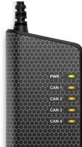
Figure 4: LEDs on the Kvaser USBcan Light 4xHS.