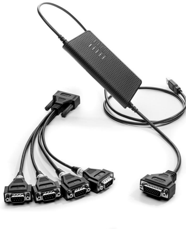
Figure 1: Kvaser USBcan Light 4xHS

Kvaser USBcan Light 4xHS is a small, yet advanced, portable multi channel CANto USB real time interface that handles transmission and reception of standard and extended CAN messages on the CAN bus with a high time stamp precision. The Kvaser USBcan Light 4xHS is compatible with applications that use Kvaser's CANlib.