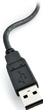
Figure 2: A standard USB type “A” connector.

The Kvaser USBcan Light 4xHS has a standard USB type “A” connector.