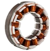
Motor stator coil

Unbalance DCR which happen on 3 phase motor may cause defection on motor.