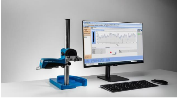
Waveline W15 with optional height measuring stand HS300 and monitor

Modular roughness measurement in every position