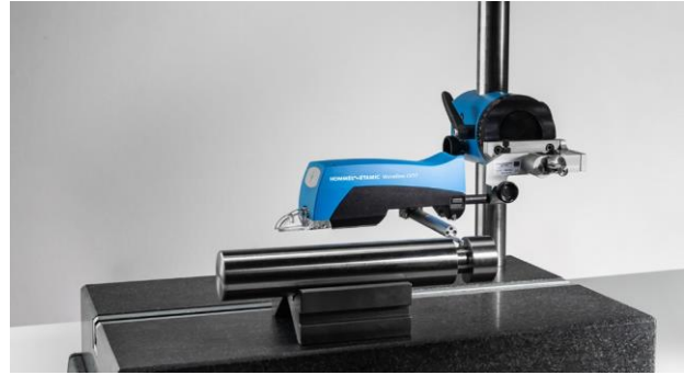
Transverse probing without retooling