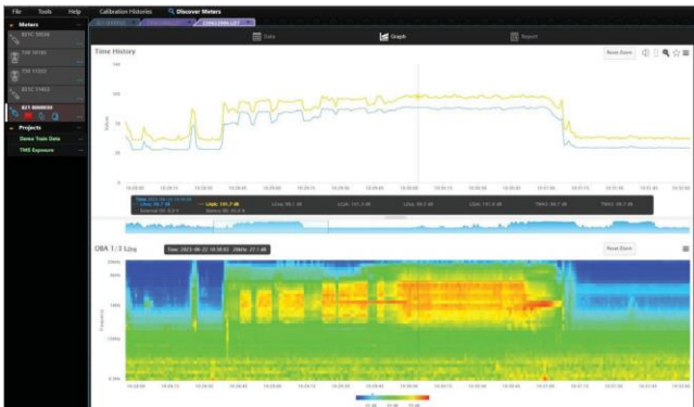
Time History Graph with optional 1/3 Octave Band data