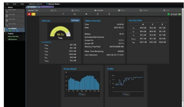
Live Sound Measurement View