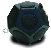
BAS001 Omnidirectional Source