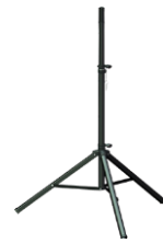
TRP023 Heavy Duty Tripod