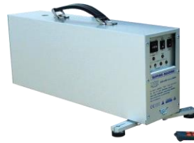
BAS004 Tapping Machine