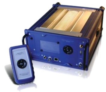
BAS002U/E Lightweight Power Amplifier