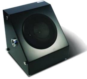
BAS003 Directional Source