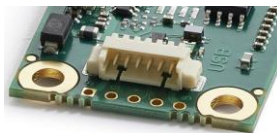
Figure 2: The USB connector.

The Kvaser Leaf v3 CB has a 6-way connector for connecting USB which has the pinout described in Table 2. The connector is mated with a Molex 51021 PicoBlade™ (e.g. housing 51021-0600 and terminal 50079-8000). There are also holes for soldering wires directly or use a 5-pin 2.54mm pitch straight pin header or board stacker like e.g. Würth 61300511121 or 61303211221.