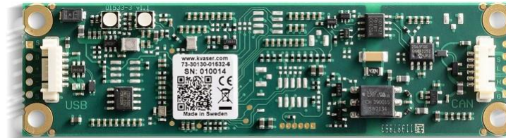
Figure 1: Kvaser Leaf v3 CB

Kvaser Leaf v3 CB is a reliable low cost product. With a timestamp precision of 50 microseconds it handles transmission and reception of standard and extended CAN messages on the bus. It is compatible with applications that use Kvaser's CANlib.