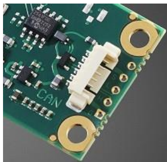
Figure 3: The CAN connector.

The Kvaser Leaf v3 CB has one CAN channel via a 6-way connector which has the pinout described in Table 4. The connector is mated with a Molex 51021 PicoBlade™ (e.g. housing 51021-0600 and terminal 50079-8000). There are also holes for soldering wires directly or use a 4-pin 2.54mm pitch straight pin header or board stacker like e.g. Würth 61300411121 or 61303211221.